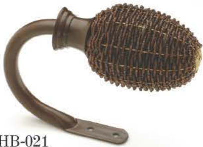
AHB-021 x:6¼ y:4½ z:2½