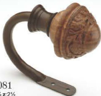
AHB-081 x:5½ y:4½ z:2½