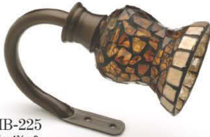
AHB-225 x:6½ y:4¼ z:3