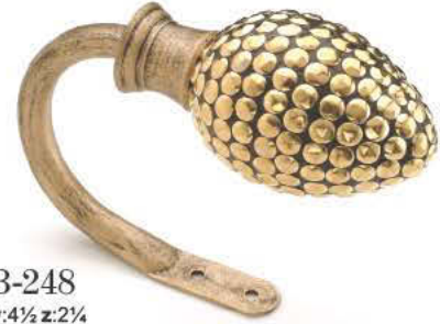
AHB-248 x:6½ y:4¼ z:2¼