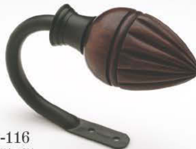
AHB-116 x:6½ y:4¼ z:2½