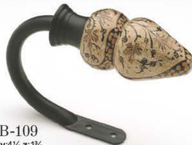
AHB-109 x:6¼ y:4¼ z:1¼