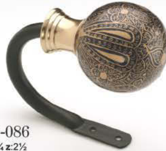
AHB-086 x:5 y:4¼ z:2½