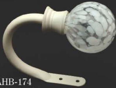
AHB-174 x:5½ y:4¼ z:2½