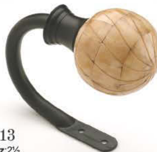
AHB-113 x:5½ y:4¼ z:2½