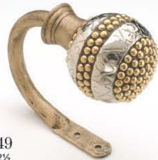
AHB-249 x:5 y:4½ z:2½