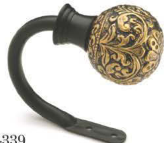
AHB-339 x:5 y:4¼ z:2¼