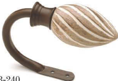
AHB-240 x:6½ y:4¼ z:2½