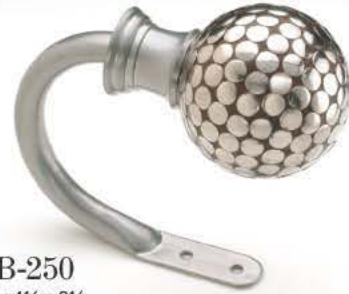
AHB-250 x:5½ y:4¼ z:2½