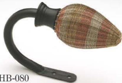
AHB-080 x:6¼ y:4¼ z:2½