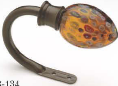
AHB-134 x:6½ y:4¼ z:2