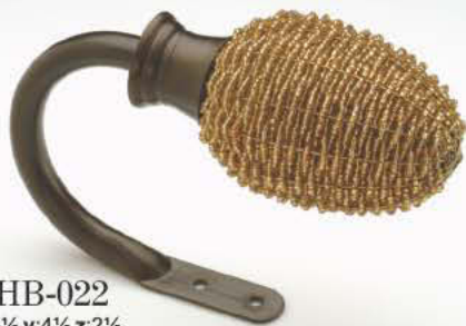
AHB-022 x:6¼ y:4½ z:2½